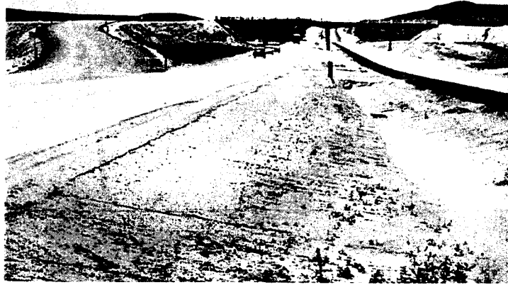
Interchange on Denver-Co